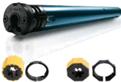
Wheels and crowns for cylindrical and octagonal tubes.

Roman blinds are sophisticated, contemporary window coverings that come in many styles; from understated modern styles right through to the lavish and luxurious. Somfy motorisation is ideal for Roman blinds as it removes the need for unsightly pull cords and keeps everything fuss free and simple to use. Just as you intended!