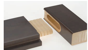
Mortise and tenon joint