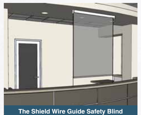
The Shield Wire Guide Safety Blind