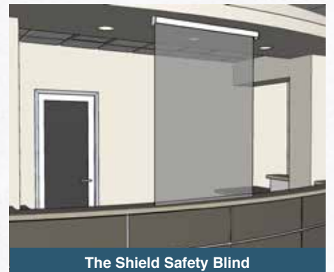
The Shield Safety Blind